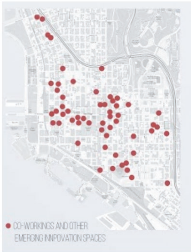
Figure 2. Map of San Diego Innovation centres (Authors' elaboration).